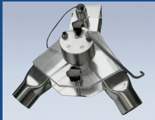
Option: Product Diverter V2000