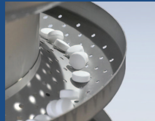
Option: Various helix surfaces available on request