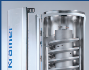
Pivoting and fully removable Window